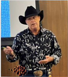
Houston Livestock Show & Rodeo (HLSR)