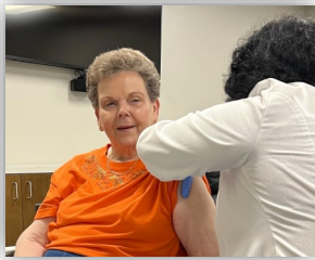
Vaccination Time! Thank you, Randall's pharmacy staff!