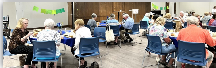
Lunch! A time to enjoy food and fellowship!