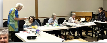
Back to the social bridge tables, and watercolor class!