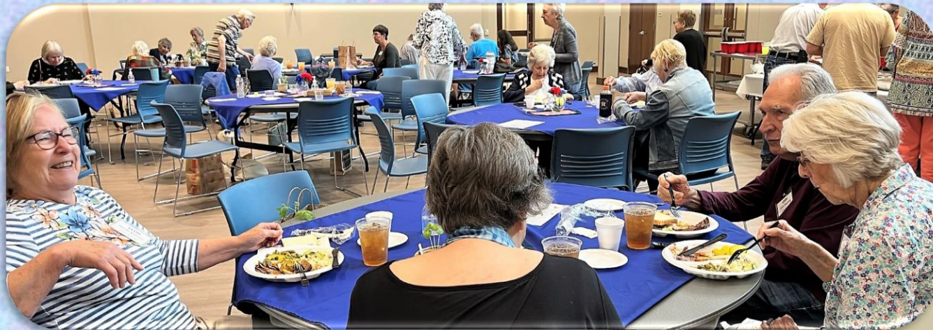
Everyone enjoyed lunch and the opportunity to visit with each other, before adjourning until the Fall session!