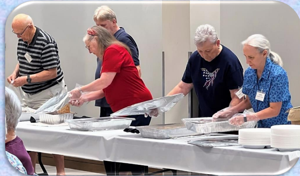
Above, part of the dedicated LEOH "Kitchen Crew" begin setting the food tables.